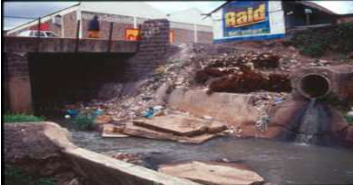
Picture 2 Polluting Mbagathi River by sewage draining sewage Photo taken on 17th February, 2016

The above image shows how the community directs sewers, dirty water and other waste products to the river. This is attributed to lack of information among community members on how industrial waste and socio-economic factors contribute to pollution of rivers. IWRM has neglected its principle of incorporating all stakeholders in participating in projects which promote water resource management. When water resource is not well managed things like public health, food security, the environment, industry and infrastructure suffer when access to water is uncertain. During drought, livestock die, crops fail, water quality is degraded, rivers and lakes dry up, and dams silt up. In floods, the damage to crops and infrastructure is significant and again degradation of water quality occurs.